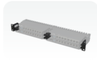
Rackmount kit K-79