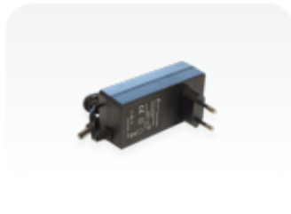
24 V 1.5 A power adapter